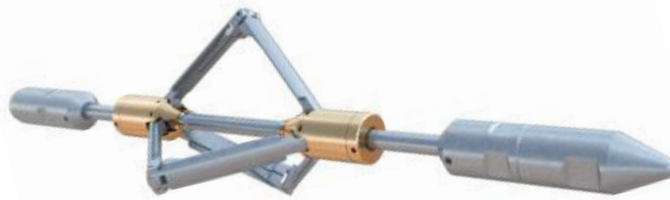
RCT 10 & RCT 11 3-Arm Roller Centralizer Tools