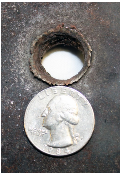
60% improvement over previous circulating charges